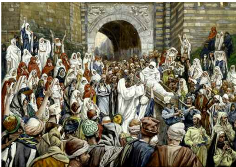
Watercolor over graphite on gray wove paper, J. James Tissot, 1836-1902, Brooklyn Museum of Art

Today, more than ever, we need rest from the clamor of the world. We can most effectively analyze our thoughts, chart the course of our aspirations, and commune with the highest, when we are alone and all is quiet about us. Elijah, we must remember, did not receive an answer to his problem when the storm was raging or during the turbulence of earthquake and fire. Only when the sounds of destruction and disharmony had ceased did the “still small voice” issue its commands to save Elijah’s life. Sick people have an even greater need for solitude and silence, which is medicine