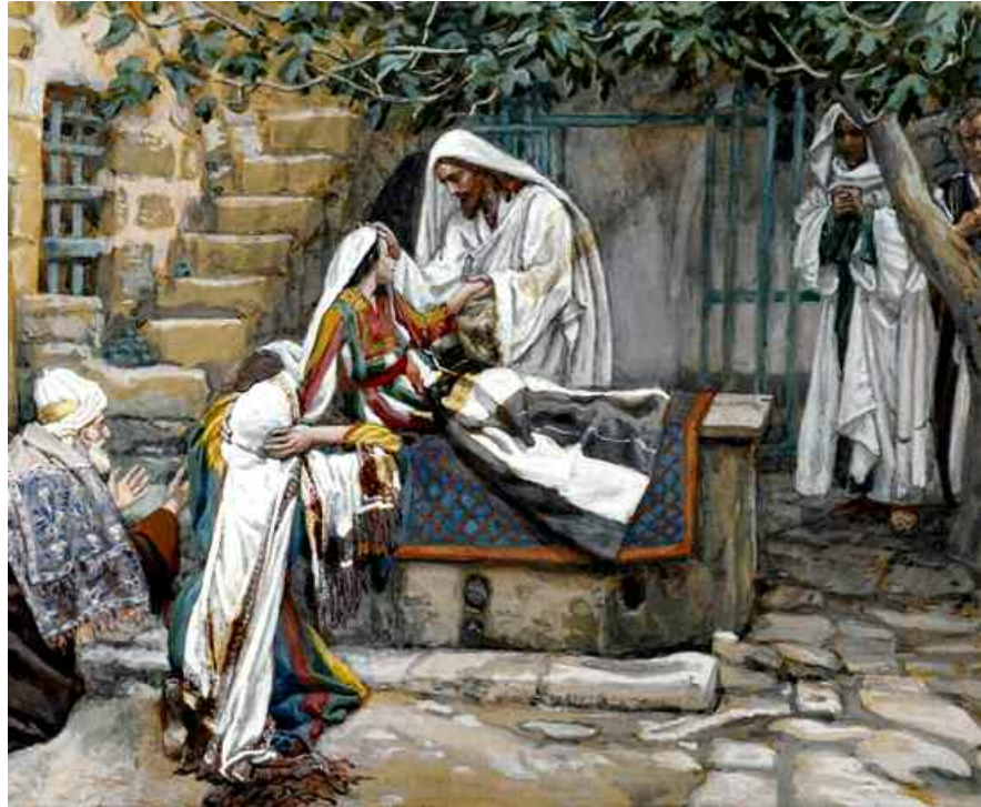
Watercolor over graphite on gray wove paper, J. James Tissot, 1836-1902, Brooklyn Museum of Art

Let us take the first step, that of PURITY. It has been said that Christ’s gospel could never have been delivered by one who was diseased. Likewise, it is certain that the healing miracles performed by Christ Jesus could