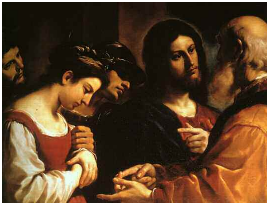
Oil on canvas, 1621. Giovanni Francesco Barbieri (Guercino), 1591-1666, Dulwich Picture Gallery, London, England

If we examine ourselves closely, we are likely to find an astonishing amount of debris in the form of resentments left over from episodes long past, of which we may be only vaguely aware, but which still gnaw at us. In order to be completely forgiving—completely free—we must rid ourselves of even the tiniest of these resentments and put them out of our minds forever. The principle of forgiveness pervades all nature. For instance, our bodies put up heroic defenses to contend with the flagrant abuses involving improper diet and destructive