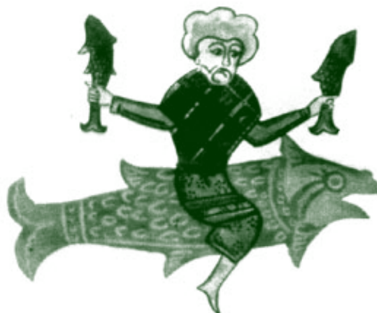
Armenian manuscript, number 3884, 1461 A.D., Madenataran Erevan, Armenia

Pisceans have a deep love of music and are fine musicians when they pursue music as a lifework. They make wonderful doctors and in any area of