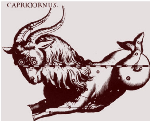
Hevelius, 1690, New York Public Library

The positive qualities of the Capricorn people are leadership, patience, persistence, efficiency and practicality. They are ambitious and willing to