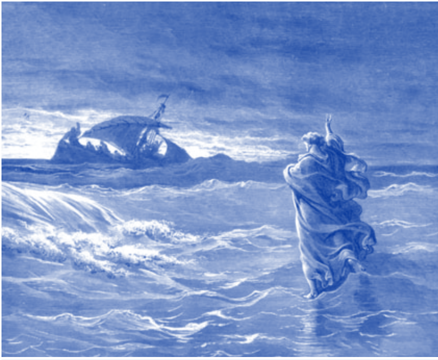
Illustration for the Bible, 1866. Gustave Doré

“They see Jesus walking on the sea, and drawing nigh unto the ship: and they were afraid; but he saith unto them, It is I; be not afraid”—John 6:19-21.