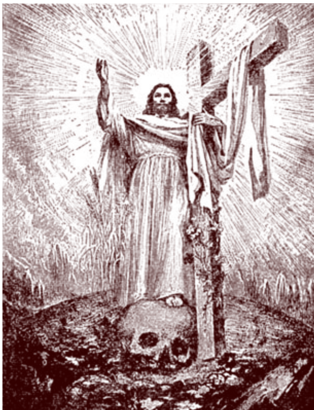
Created by Ariel Agemian exclusively for the Confraternity of the Precious Blood