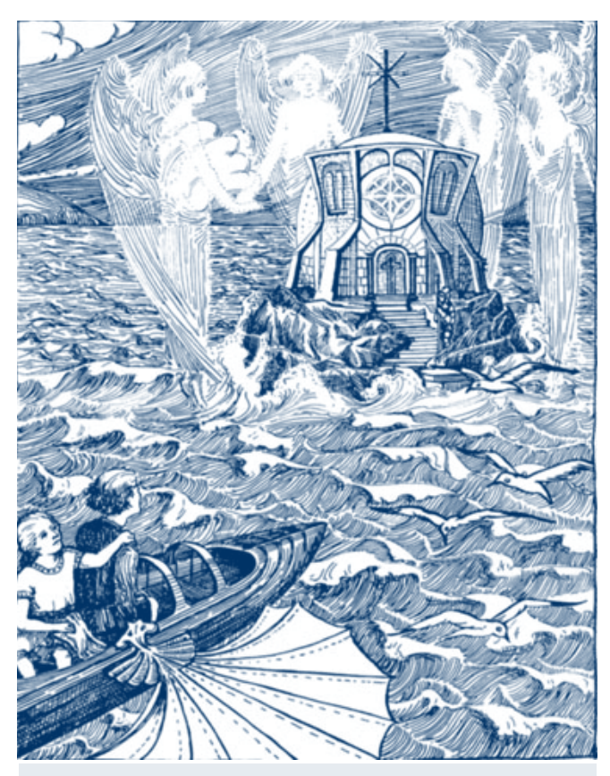
The Land of the Fishes

"Rex and Zendah from earth," they said, "and the Password is love .