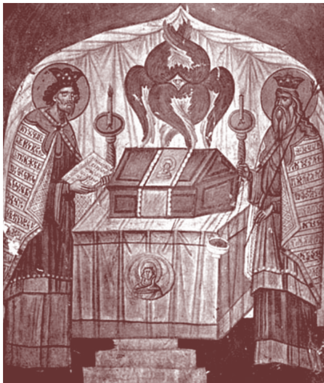
Fresco, Lesnovo Monastery, Serbia, 14th century.

Christ also explained at that time in mystic but unmistakable language what that living bread, or manna, was, namely, the Ego. This explanation will be found in verses 33 and 35 [John 6], where we read: "For the bread of God is he which cometh down from heaven and giveth light unto the