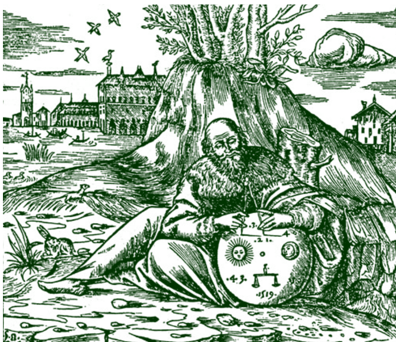
From Albul Hassan Ali's Praeclarissimus in Juditijs Astrorum , Venice, 1519.

When the fixed cross is prominent, there is peace; powerful rulers and leaders hold the world's turbulence in check. Then there is a time, when the common or mutable cross is in evidence, stirring