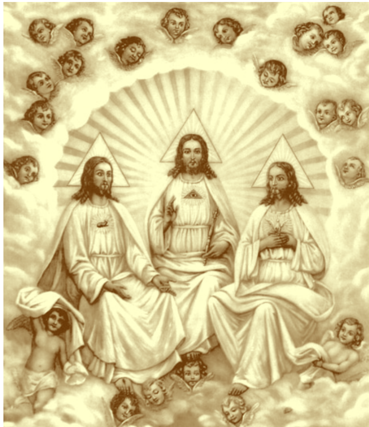
Cromos y Novedades de Mexico, S.A.

Christ could not be born in a dense body because He had never passed through an evolution such as the Earth Period; therefore He would first have had to acquire the ability to build a dense body such as ours. But even had He possessed that ability, it would have been inexpedient for such an exalted Being to expend for that purpose the energy necessary for body-building through antenatal life, childhood and youth, to bring it to sufficient maturity for use. He had ceased to use vehicles such as would correspond to our Human Spirit, mind, and desire body, although He had learned to build them in the Sun Period, and retained the ability to build and function in them whenever desired or required. He used all His vehicles, taking only the vital and dense bodies from Jesus. When the latter was thirty years of age Christ entered these bodies and used them until the climax of His mission on Golgotha. After the destruction of the dense body, Christ appeared among His disciples in the vital body, in which He functioned for some time. The vital body is the vehicle which He will use when He appears again, for He will never take another dense body.