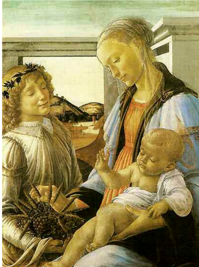
Painting (c. 1470), Sandro Botticelli (1445-1510), Isabella Steuart Gardner Museum, Boston

You will remember that the Christ said, "He that would be the greatest among you, let him be the servant of all." Therefore Mercury in Virgo or the sixth house is really one of the most beneficial positions that anyone can have; not perhaps so far as earthly treasure is concerned. but for those who love to lay up treasure in heaven, where moth and