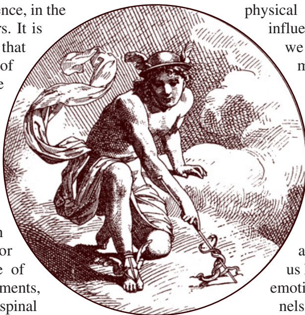
Fleet (wing-footed) Mercury with double serpent caduceus and winged petasos, symbolizing quick thinking.