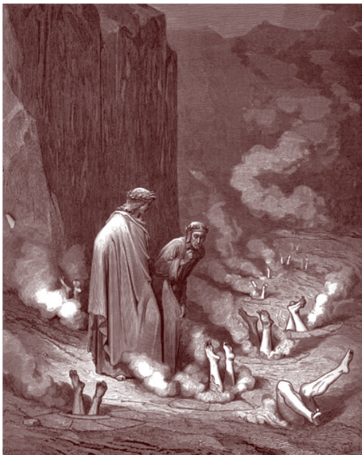
From Illustrations for Dante's Divine Comedy , Gustave Doré (1833-1883)

Many saints have written about the effects their visions and mystical experiences exerted on their personal characters: St. John of the Cross tells us that “they enrich it [the soul] marvelously. A single one of them may be sufficient to abolish at a stroke certain imperfections of which the soul during its whole life had daily tried to rid itself.” St. Theresa says, “A genuine heavenly vision yields to her a harvest of ineffable spiritual riches, and an admirable renewal of bodily strength. I alleged those reasons to those who so often accused my visions of being the work of the enemy of mankind....All those who knew me saw that I was changed; my confessor bore witness to the fact.... As for myself, it was impossible to believe that if the demon were its author, he would have used, in order to lose me and lead me to hell, an expedient