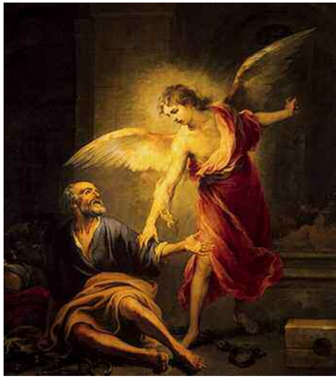
Bartolome Esteban Murillo, State Hermitage Museum, St. Petersburg, Russia

There are several instances in the Bible of the temporary suspension of certain physical laws, such as gravity and the conduction of heat, but never merely for show. Christ walked upon the water in order to reach the boat in which His disciples were being tossed about by a “contrary” wind. The lives of Shadrach, Meshach and Abednego were preserved in the “seven times heated” furnace. The “gift of tongues” was not given originally as a “sign.” It was given, as recorded in the second chapter of Acts, for a specific purpose; i.e., in order that the foreign-born Jews in the city of Jerusalem might understand the gospel when it was preached. One modern recorded instance of the gift of