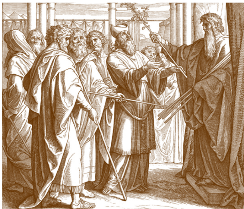
From Die Bibel in Bildern , Julius Schnorr von Carolsfeld (1789-1853)

candidate proceeded further westward, and when he came to the westernmost part of all, the Holy of Holies, there was seeming darkness where stood the Ark of the Covenant. Above it there burned a spiritual light , spoken of in the Bible as “Shekinah Glory” which hovered above the Ark as a symbol of the purified man. While he was at the Eastern gate and the light shone without, the law was also without as a taskmaster which he only obeyed because he must. At this western end of the tabernacle he finds the Ark with the tables of the law within, symbolical of the fact the man who has attained to that height has taken within himself all the laws of nature and is at one with them. Therefore he obeys them readily; they are not to him taskmasters. He would not act contrary to them if he could. The golden pot of Manna, symbolizing the bread that came