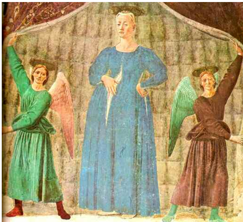
Fresco (1460), Piero Della Francesca (1422-1492), Chapel of the Cemetery, Monterchi

The animals have twenty-eight pairs of spinal nerves and are now in their Moon stage, perfectly attuned to the twenty-eight days in which the Moon passes around the zodiac. In their wild state, the Group Spirit regulates their mating. Therefore there is no overflow with them. Man, on the other hand, is in a transition stage; he is too far progressed for