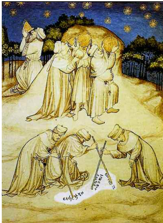
Cover of Sir John de Mandeville's Travels , Bohemia, 1410-1420, British Library, London

Misunderstood and criticized, denied the companionship of others, he will be driven back upon his own devices for enjoyment. He may become a glutton, for the Moon, ruler of the ASC, is in Taurus, which has dominion over the palate, and serious illness would follow gastronomic excess. The astrologer sees these tendencies, but is, of course,