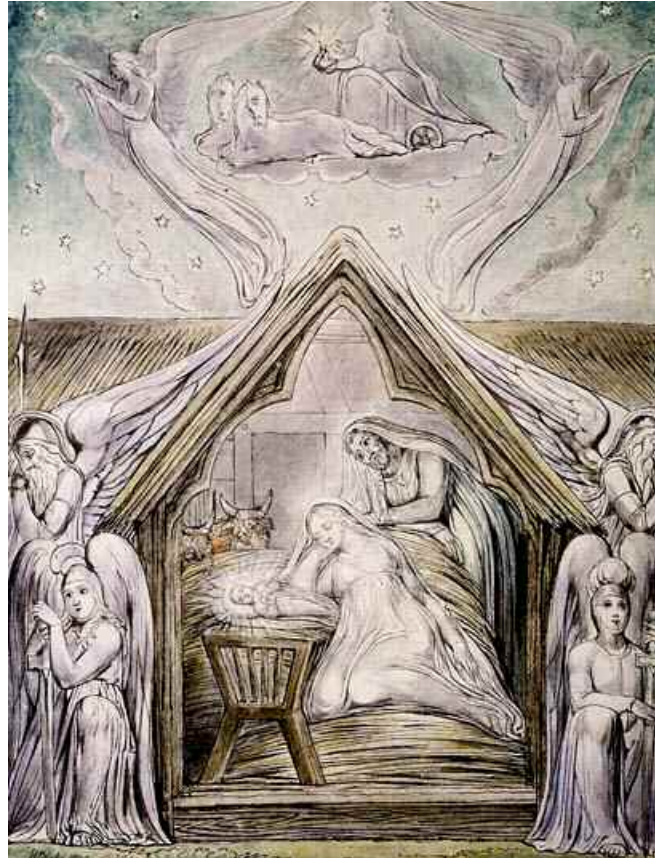
William Blake (1757-1827), Illustration for Milton's "On the Morning of Christ's Nativity," Nativity Ode 6, 1809, 25.5 x 19.3 cm, Whitworth Art Gallery, University of Manchester

A true interpretation of the Christmas legend necessitates first of all an understanding—however dim it may be at first—that the birth of the Christ Child in the manger in the stable among the animals, symbolizes the first faint upspringing of the Christ consciousness in animal man. The tiny indwelling flame which is the Christ flame has been hitherto dormant in the human constitution. It now receives sufficient stimulus to enable it to