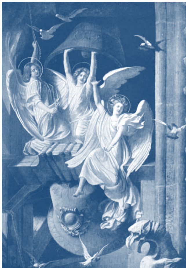
Oil on canvas (16 ft. x 12 ft.), Edwin Howland Blashfield (1848-1936), Brooklyn Museum

Paul exhorted us to be always ready with a reason for our faith, and there is a mystic reason for many practices of the church which have been handed down from hoary antiquity. The sounding of the bell when the candle is lit upon the altar was inaugurated by spiritually illumined seers to teach the cosmic unity of light and sound. The metal tongue of the bell brings Christ's mystic message to mankind as clearly today as when He first enunciated the graceful invitation: "Come unto me, all ye that labor and are heavy laden, and I will give you rest." Thus the bell is a symbol of Christ, "The Word," when it calls us from work to worship before the illuminated altar where He meets us as "The Light of the World."