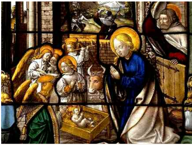
Stained glass (detail), ca. 1521. Master of St Severin, Lower Rhine, Germany