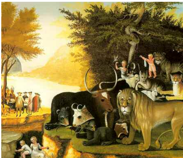
Oil on canvas, c. 1847, Edward Hicks (1770-1849), Private Collection

The microscope has told us that such a small creature as the house fly carries about on the fur of its legs thousands of parasites which we fancy are inimical to our health, and therefore fear prompts us to spend millions of dollars on fly paper, fly screens, fly traps and other devices to rid ourselves of this pest, but our efforts are largely in vain.