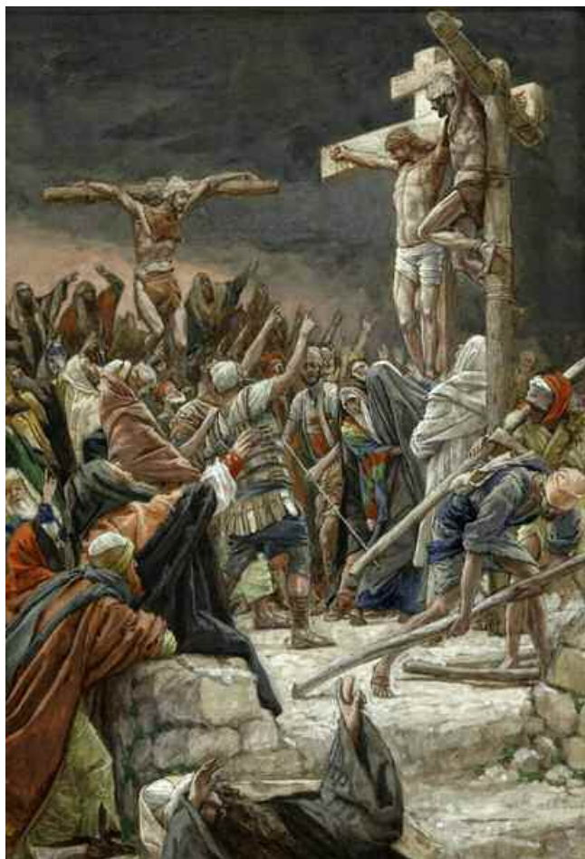
J. James Tissot, Brooklyn Museum of Art

Thus, in the last hour of Earth's history, white magic—that is to say, the force of love—will find a wide field of activity to loosen the bonds which bind human beings to earth. This effect of white magic will then be possible because "white humanity" will also have experienced a kind of Crucifixion, as has been already explained. In effect, it will then proclaim, with magic might, the message to the other section of humanity : "Dost