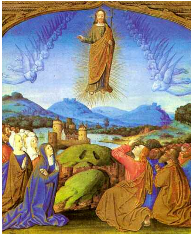
Très Riches Heures of Jean, Duke of Berry, c. 1413, Musée Condé, Chantilly

When the Sun is focussing the active rays of Aries on humanity, events of great moment often occur. The Bible records many such events. It was on the fifteenth day of April that the Israelites left Egypt—the most important date in the Old Dispensation's calendar. Joseph was released from prison on this date. Other events occurring at this time include the encampment of Sennacherib's