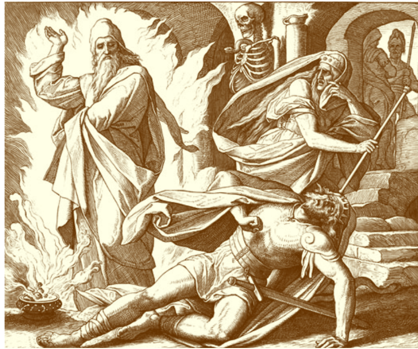
Die Bibel in Bildern, Julius Schnorr von Carolsfeld (1789-1853)

If we read the nineteenth chapter of first Samuel with this understanding we shall readily see that the incident there narrated was of a mediumistic nature. David had become afraid of Saul and he