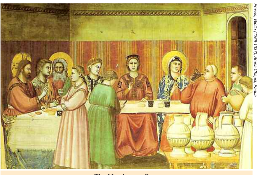
The Marriage at Cana