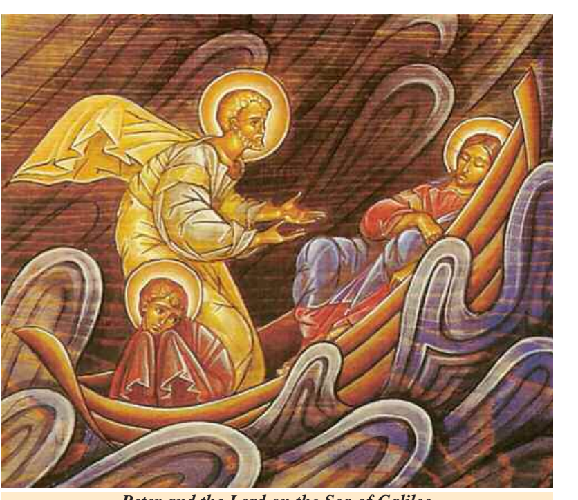
Peter and the Lord on the Sea of Galilee Making imaginative use of the wood grain to enhance the stylized depiction of turbulent waters, this iconic image shows Peter's garment billowing with wind to suggest angel wings. At the moment, the fisher of men's souls and rock of the church is troubled and seeks the Lord's stabilizing power.

Fierce was the wild billow, Dark was the night; Oars labored heavily, Foam glimmered white; Trembled the mariners, Peril was nigh: Then said the God of God, "Peace! It is I."