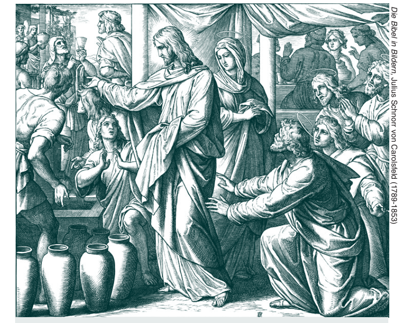
The Wedding at Cana