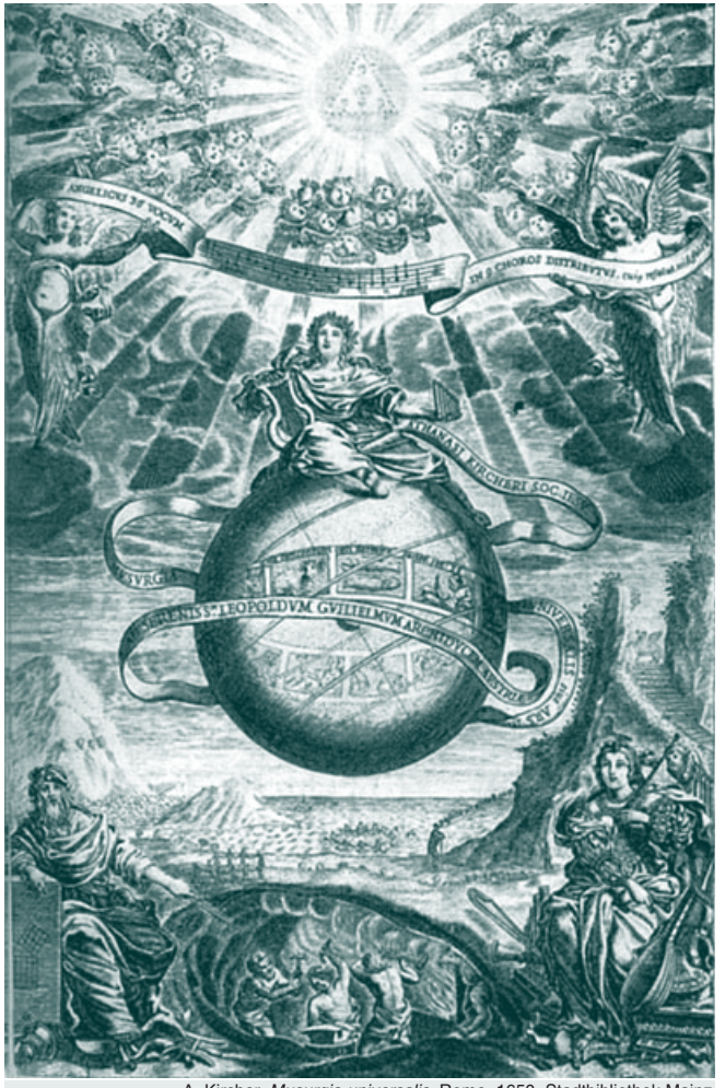
A. Kircher, Musurgia universalis, Rome, 1650, Stadtbibliothek Mainz

We are wounded by our transgressions, bruised by our iniquities. Before a physical malady can be healed permanently, the hearts and minds of men must be cleansed of evil, which is a misapplication of natural law. We must realize that every practice that is not in keeping with the ethics of a lofty mind and noble soul is a source of evil or separation, culminating in disease. Sickness, suffering, and death are the work of antagonistic forces within ourselves. Health can only be fully restored through obedience to the laws which coordinate the forces of good, obviating the need for the restoration of any violated equilibrium, physically and morally, in the universe, and thus rendering natural law harmoniously operative.