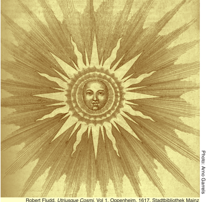
Robert Fludd, Utriusque Cosmi, Vol 1, Oppenheim, 1617, Stadtbibliothek Mainz Source and sustainer of all life on earth, the sun with its allpervading light is an apt symbol for the unity of creation.

Just as a child in kindergarten has the potential capacity for knowledge actually acquired by the grown boy in the graduation class, so too do the kingdoms below the human differ from man only in degrees or states of consciousness or awareness. Endowed with the potentialities of life and moved by natural impulse, each individualization of the one Life is ever pushing forth into greater and greater expressions. Thus the tendency of life or vital force is towards differentiations, towards separation into constituent drops—now a bird, then a