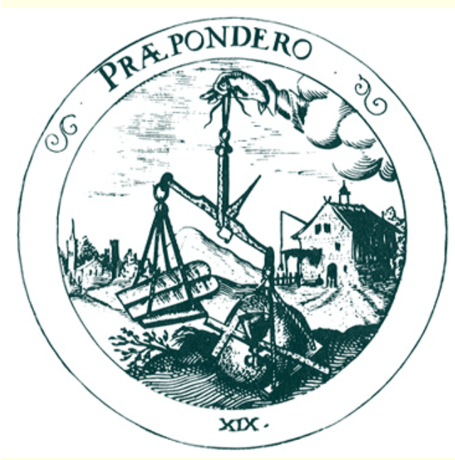
The heart, stained on the rosy altar of Christ's blood, Overcomes the weight of the law by the triumphing weight of the cross.

Emblem 18, directly preceding the above illustration, with the caption "I AM NOTHING," shows the balance reversed, the two stones of the decalogue outweighing a heart unaccompanied by a cross and a blood-filled chalice. Old Testament law brought us to Christ, but a crucified Christ was necessary to save man from the weight of sin and the merciless law that could punish but neither forgive nor regenerate. Thirty-three of these forty emblems are I AM assertions: they are affirmations of the development of individual spirit identity.