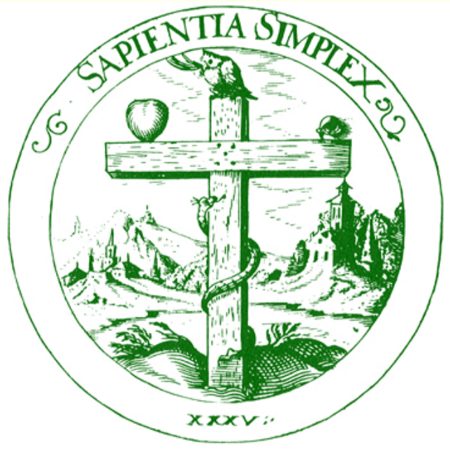
He whose heart is saved by simplicity, whose eye by wisdom, Will be both serpent and dove to God

Be ye therefore wise as serpents, and harmless as doves.—Matthew 10:16