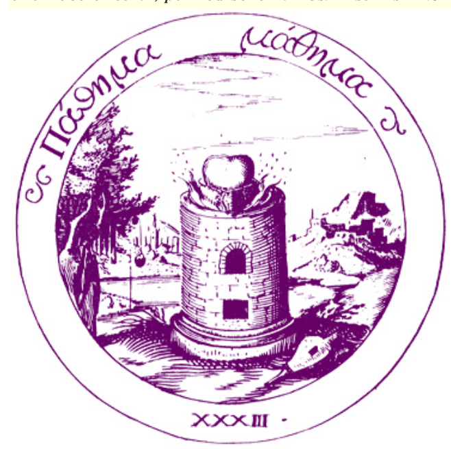
The brick and hearth Witness to the quality of gold; The same may testify to the good

The words of the Lord are pure words as silver tried in a furnace of earth, purified seven times.—Psalms 12:6