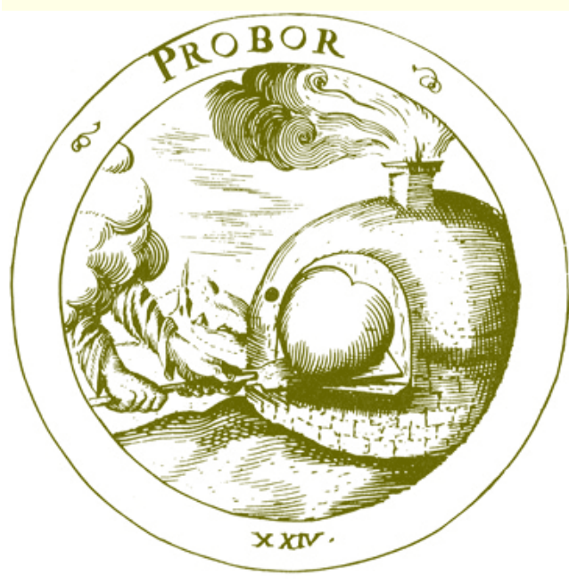
The Lord burns and tries us in the fire of the furnace. May you be upright and constant, and you will be proved good.

I have chosen thee in the furnace of affliction. —Isaiah 4:10