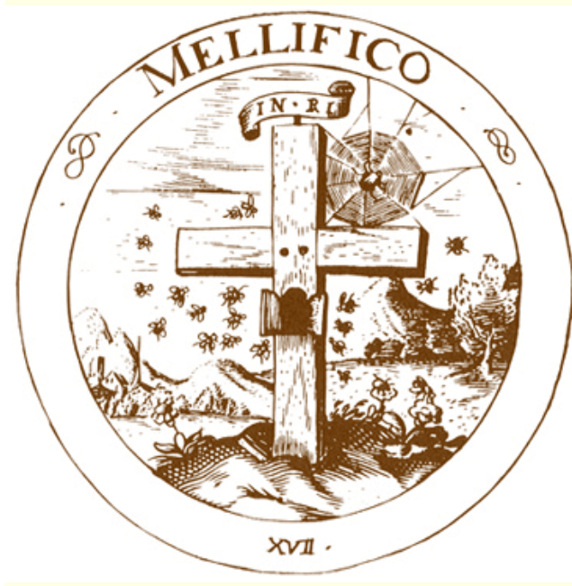
The cross, the bitterness, the smell of Christ are deadly to others, but to me they are life, the cross is love and sweet scent.

To the one we are the savor of death unto death, and to the other the savor of life unto life.—Corinthians 2:16