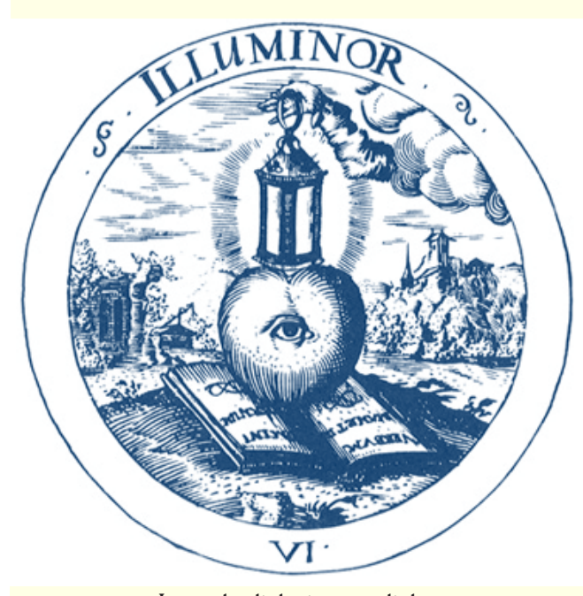
I see the light in your light. Let darkness be far away, He is wise who gains wisdom from the book of the Lord.

In thy light shall we see light.—Psalms 36:9