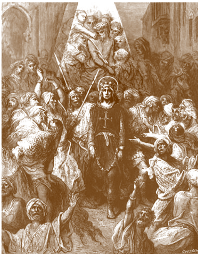
Engraving, Gustave Doré, Illustrations of the Crusades

But when we consider the case of the Christians, the matter is very different. It is true that the Christian religion also teaches that what a man