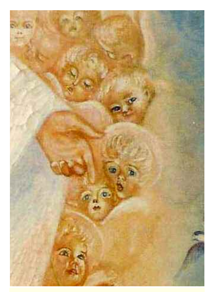
Detail of Mary Hanscom's Invisible Helper

Some may counter that ripe destiny is unavoidable, and to pray for persons under such a strong karmic influence is unreasonable, even a waste of time. Not at all! Undoubtedly, our prayer cannot