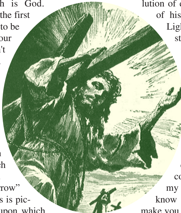
I am the Way

During this month let us meditate often on the symbolism of the Crucifixion—Spirit nailed to the cross of Matter—and apply it to ourselves, the Christ crucified in us. Let us hold in mind the Law of Cause and Effect as it operates throughout all Nature, hold it until we KNOW that the conditions which surround us and the experiences which come