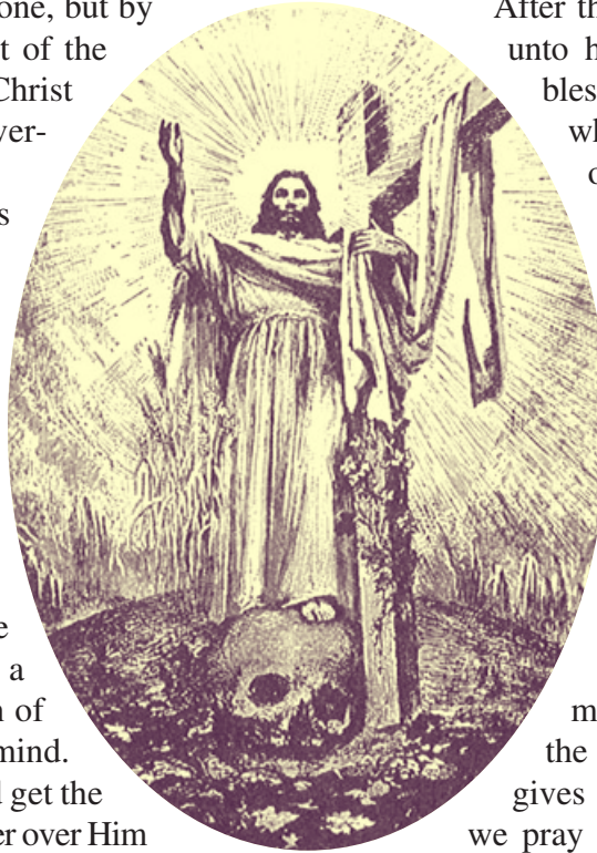
I am the Life

Created exclusively for the Confraternity of the Precious Blood by Ariel Argemian