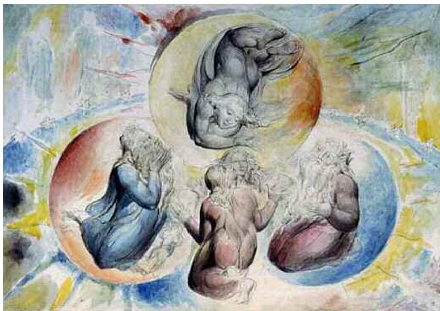
Watercolor, illustration for Dante's Divine Comedy , William Blake, c. 1825, British Museum, London

Both the Virgin Mary and Christian Rosenkreutz, who is the reincarnation of John the Beloved, have attained the the Consciousness of the Vulcan Period through the Great Work both have accomplished under the guidance of Christ Jesus. They have thus surpassed the Venus Period Consciousness, which is a supreme Love Consciousness, described as Objective, Self-conscious, Creative consciousness. Our Lady has always been depicted with her Heart in the middle of her bosom, which reflects a perfect balance between the Mind and the Heart. If Christian Rosenkreutz were painted, his Heart would have to be depicted in the middle of his