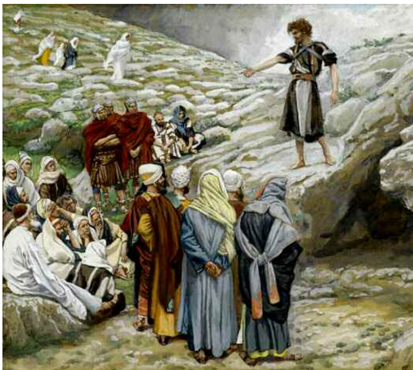
Opaque watercolor over graphite on gray wove paper. J. James Tissot.

T HESE THREE quotations from the three synoptic Gospels illustrate how three separate personalities reacted to the same thought. How very important it is for each one of us to make our own contacts with universal truth, not relying on an intermediary, because the revelations of a sec-