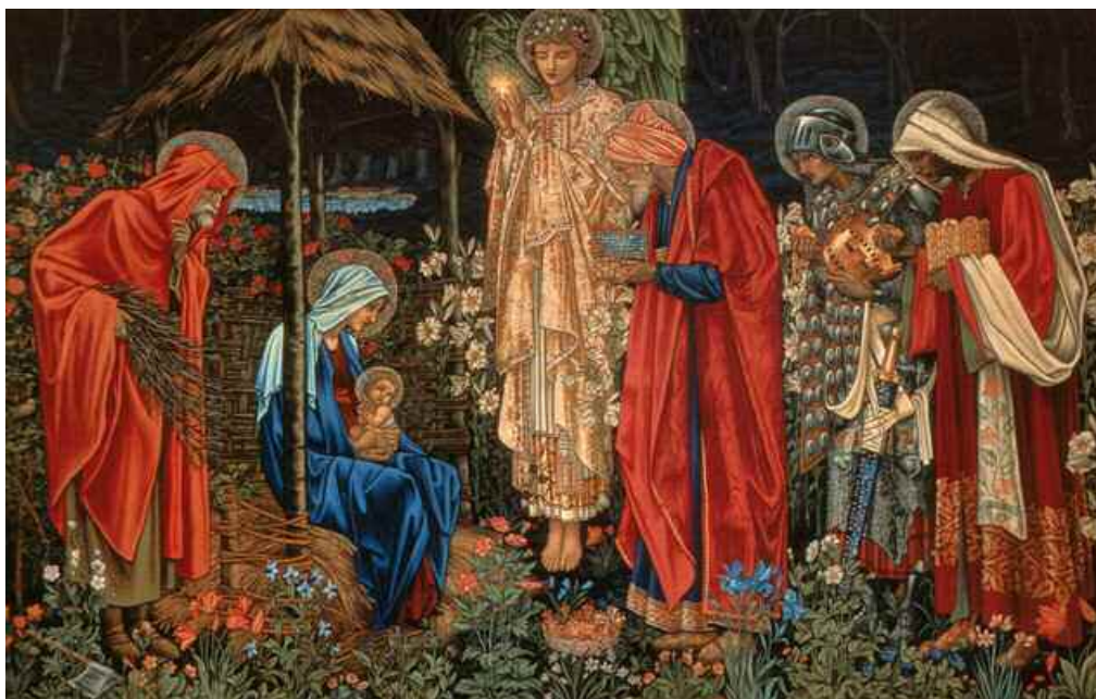
Tapestry 1891, Sir Edward Burne-Jones (1833-1898), wool and silk on cotton warp, Manchester Metropolitan University

Therefore, the gift of one wise man is the Spirit. The next one brings myrrh. Myrrh is the extract of an aromatic plant that grows in Arabia, a very rare plant, very rare indeed. Therefore, it symbolizes the thing that man extracts when he cleanses himself. When he has cleansed his blood of passion he becomes plant-like, chaste and pure. Then his body is an aromatic essence. It is an actual fact that there are men and women so holy that they emit an aroma