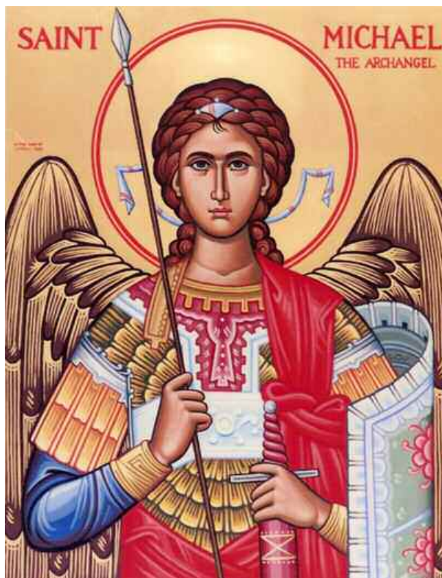
Brother Simeon, 1986, © Monastery Icons

The Race Spirit took special care of certain sects of people, for example, the Levites among the Jews, who were destined specially for priesthood and they were herded around the temples and were specially bred to be the forerunners and teachers of their brethren. Their system of mating and regulation of the sex life of these special protégés produced a more lax connection between the vital body and the dense body, which was necessary in order that Initiation might take place and help man to advance. As long as the Race Spirit works with us we are under the law, we are only overcoming the influence of the desire body; therefore Paul says well that the law was until Christ. Not until Christ came 2,000 years ago, but until "Christ be formed in you." When we release ourselves from the toils of the desire body and live up to the vibrations of the vital body, we become imbued by the Christ Spirit. Then