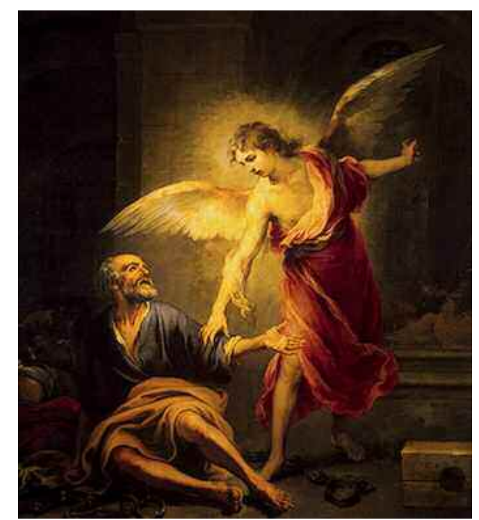
Bartolome Esteban Murillo, State Hermitage Museum, St. Petersburg, Russia Liberation of St. Peter

There are several instances in the Bible of the temporary suspension of certain physical laws, such as gravity and the conduction of heat, but never merely for show. Christ walked upon the water in order to reach the boat in which His disciples were being tossed about by a "contrary" wind. The lives of Shadrach, Meshach and Abednego were preserved in the "seven times heated" furnace. The "gift of tongues" was not given originally as a "sign." It was given, as recorded in the second chapter of Acts, for a specific purpose; i.e., in order that the foreign-born Jews in the city of Jerusalem might understand the gospel when it was preached. One modern recorded instance of the gift of