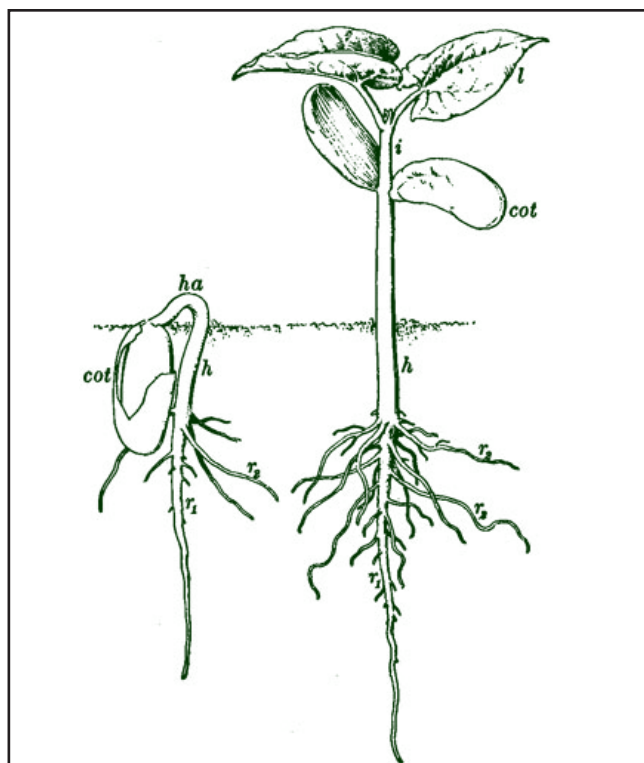
Two stages in the growth of the bean seedling: showing the seed leaves or cotyledons (cot); hypocotyl (h) or little stem; hypocotyl arch (ha); internode (i) between two leaf levels; leaf; taproot ( r_1 ) which proceeds from the tip of the hypocotyl; and secondary roots ( r_2 ) branching off the taproot.

2. Most SEEDS contain a great deal of phosphorous, an important mineral for spiritual aspirants who want to increase their alertness and mental abilities.