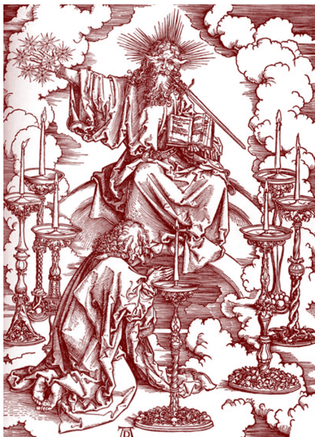
Woodcut, Albrecht Durer, 1496-98, State Hall of Art, Karlsruhe

What is said of our current fifth sub-epoch, Sardis? "Thou hast a name that thou livest, and art