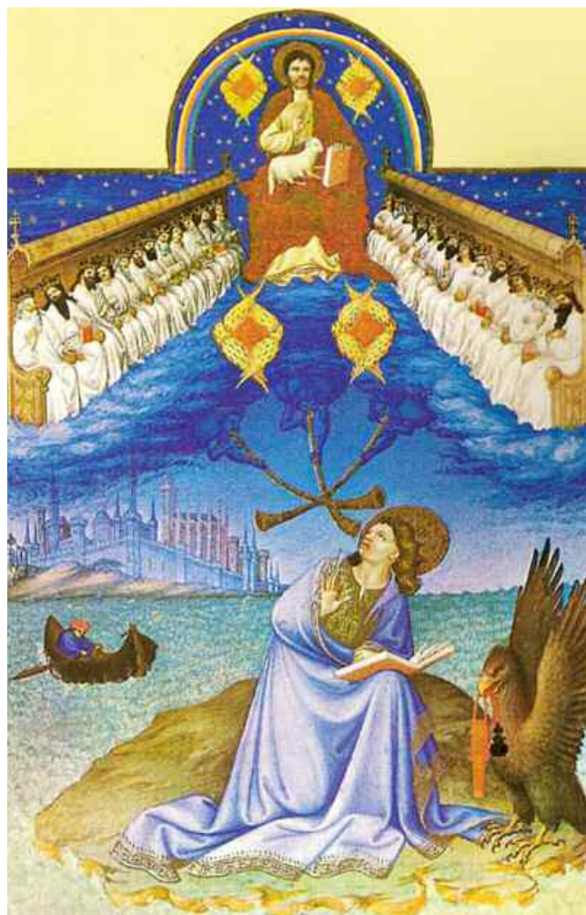
From Book of Hours (Très Riche Heures) , Jean Duc de Berry

Earliest (pre-Christian) initiation focused on thinking. The nearer Christian times were approached,