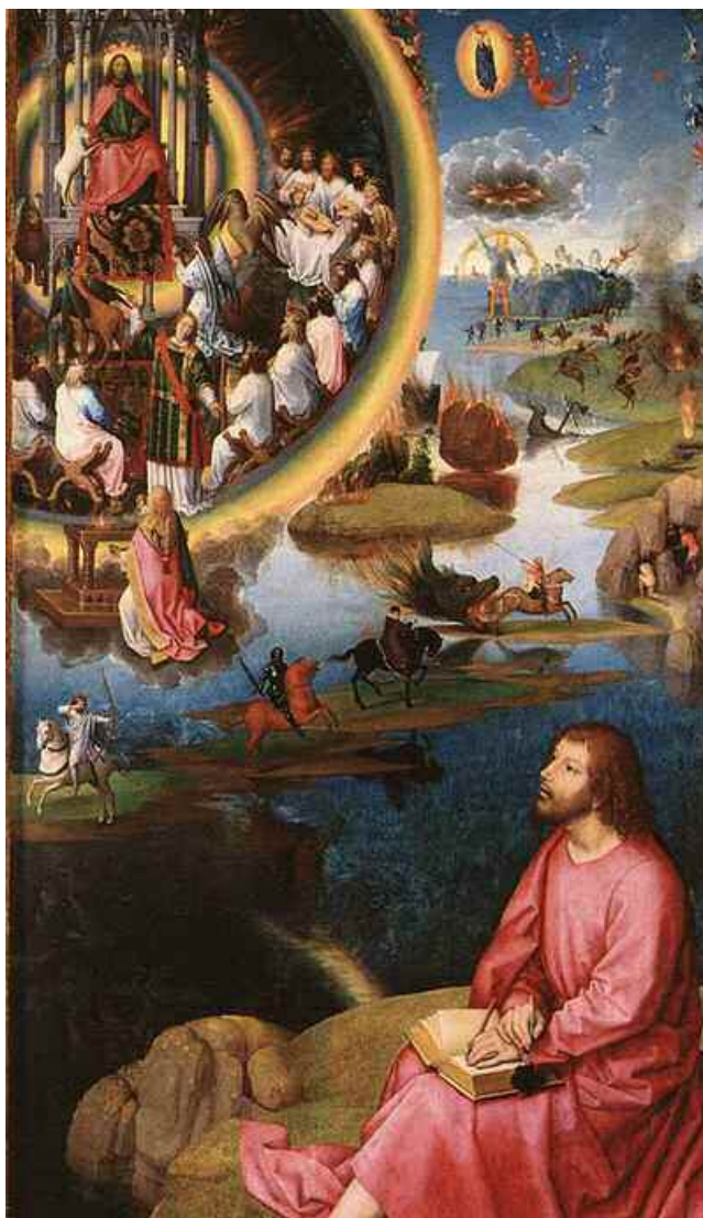
Hans Memling (1430/40-1494), Oil on oak panel. Right wing of St. John Altarpiece, Memling Museum, St. John's Hospital, Bruges, Belgium

The author of the Apocalypse (Greek for “uncovering”) is a divinely appointed link in the chain of transmission of God’s Word through its revealer and testifier, Christ Jesus, as mediated by His angel, to general humanity. While John’s record is a series of prophecies, almost wholly given over to what is not yet but shall come to pass, more than any other scriptural document it assumes and draws