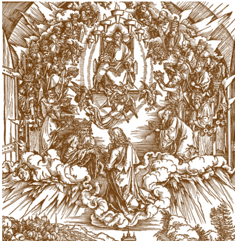
Woodcut, 1496, Albrecht Durer, State Art Hall, Karlsruhe

Man owes every soul quality he now possesses to his rejection, during his evolutionary development,