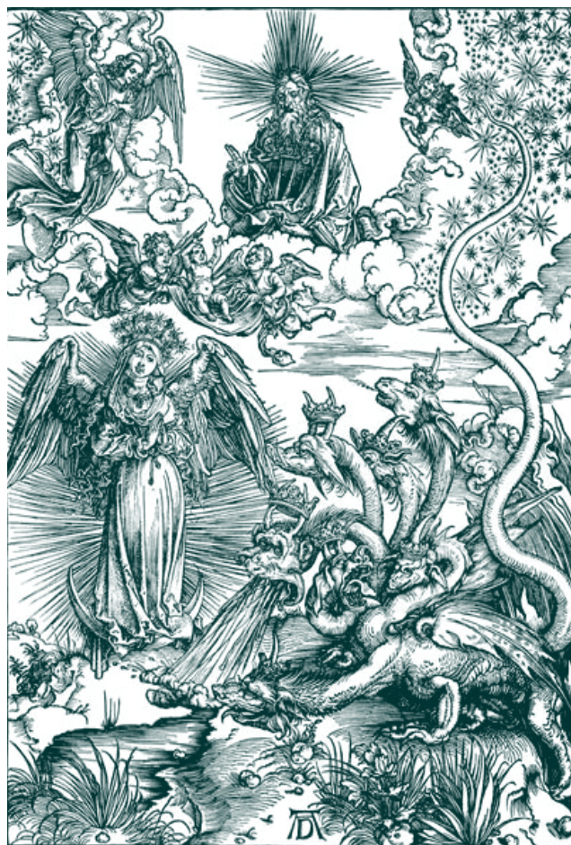
Woodcut, 1497-98, Albrecht Durer, State Hall of Art, Karlsruhe

In the Rosicrucian Christianity Lectures (No. 9),