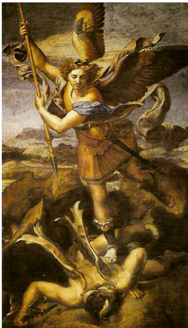
Raphael. 1518. Oil on canvas. Museo del Prado, Madrid, Spain

Interpretation of the Beast symbolism in terms of occult anatomy suggests that the seven heads are etheric centers and the ten heads are the corresponding seven ductless glands (pineal, pituitary, thyroid, pancreas, parathyroids, adrenals and gonads/ovaries), the last three of which are paired. The Beast that emerges from the sea lives