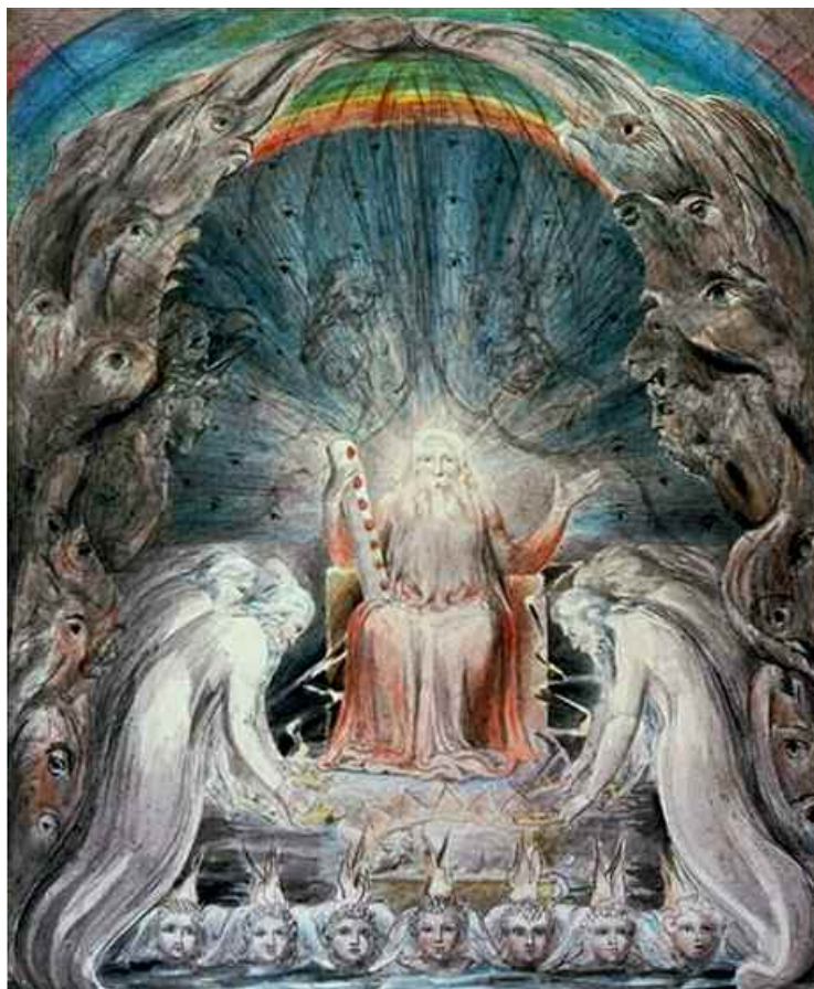
Watercolor, 1805, William Blake, Tate Gallery, London

While the Dragon was cast down from heaven, a second beast (Chapter 13) rises up out of the sea as the embodiment of our unconsciousness, the history of our submerged earthly experience. Its precursor