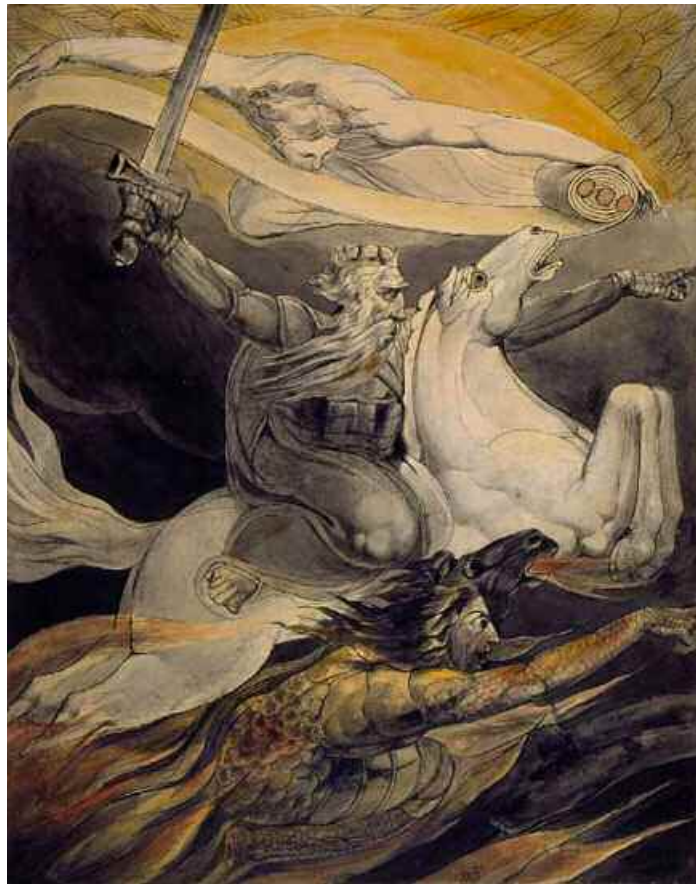
Pen, Indian ink, and watercolor on paper. William Blake. Fitzwilliam Museum, Cambridge, U.K.

Specifically, the sequence of four apocalyptic horses and riders portrays the gradual increase of material reason, of an intellect becoming more earthbound. Each of the four beasts introduces a horse and rider. The rider on the white horse (Indian Culture) represents pure intellect as the keen archer who hits the mark. The sublime wisdom of the Seven Rishis and the Bhagavad Gita come from this era. The red horse (Persian/ Chaldean Culture) indicates desire nature binding the mind and using it for invasive (sword-bearing) purposes. The mind represented by the black horse (Egypto-Sumerian Culture) has become material (opaque to spiritual light) and its rider uses it to measure and weigh the dense physical world. The pale (actually "putrid" in Greek) horse (Greco-