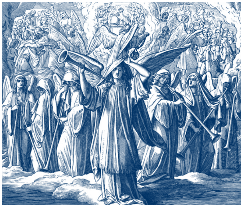
From Die Bibel in Bildern , 1860, Julius Schnorr von Carolsfeld

The sphere of the Seventh Trumpet actually carries the seer and the reader to the end of Revelation and has been described as "the apocalypse within