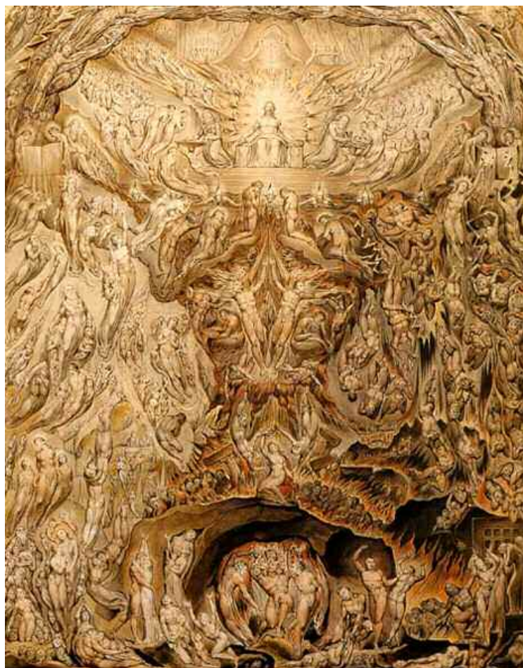
William Blake, 1808

Revelation concludes with highly charged images and an exaltation of praise and song as the marriage supper of the Lamb is prepared. Formerly the Lamb was the supper, the sacrificed Lamb, "slain from the foundation of the world" (13:8). Michael, the countenance of Christ, the "angel standing in the sun," announces the Wedding Feast. The Sword of Truth, the Word of God, slays