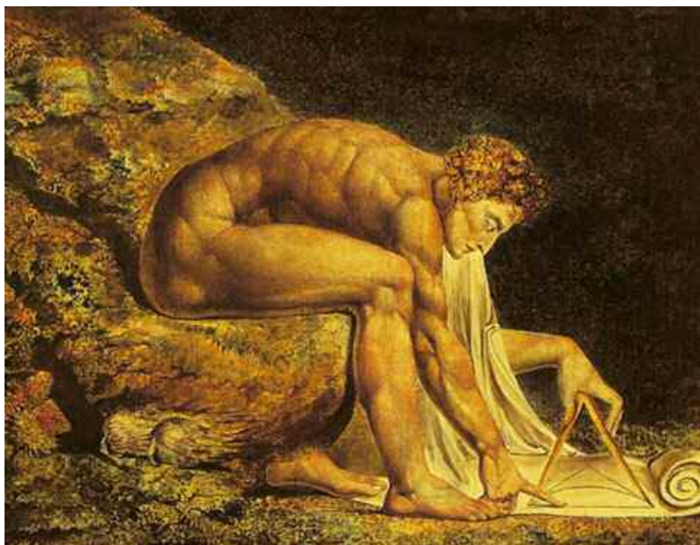
Monoprint, with pen and watercolor, 1795, William Blake, Tate Gallery, London

What is the antidote to this attitude and activity? Vital, living Christianity, adhering to the Hippocratic injunction, first do no harm . Vital Christianity has been described as Christianity without religion, without the man-built apparatus that blocks the door to the living Christ.