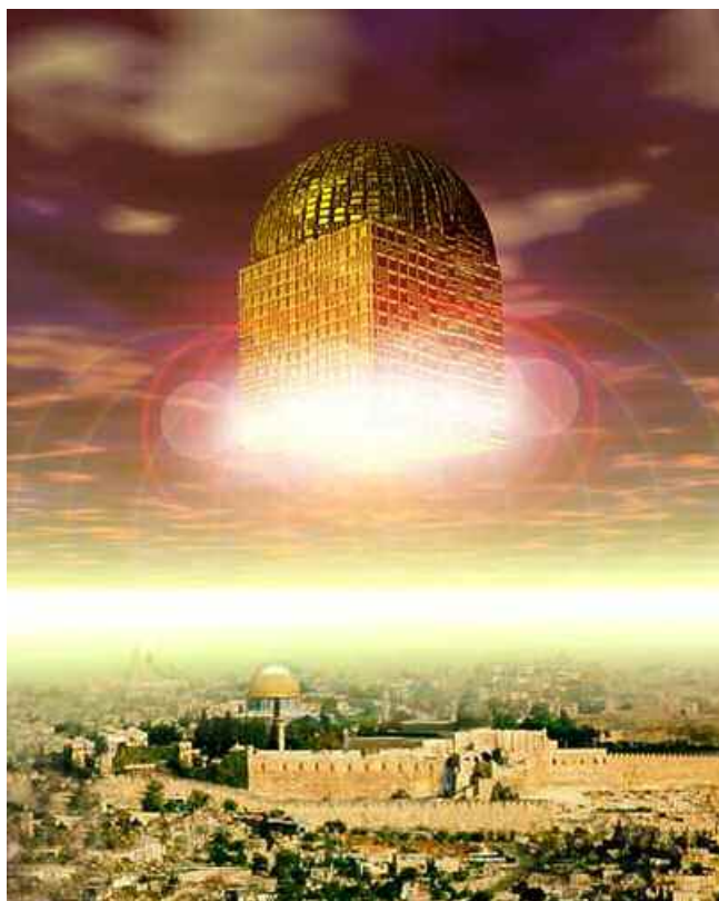
“And he carried me away in spirit to a great and high mountain, and shewed me that great city, the holy Jerusalem, descending out of heaven from God.”—Revelation 21:10

The One Who makes all things new (20:5) shall enable humans to do likewise. They shall sing a