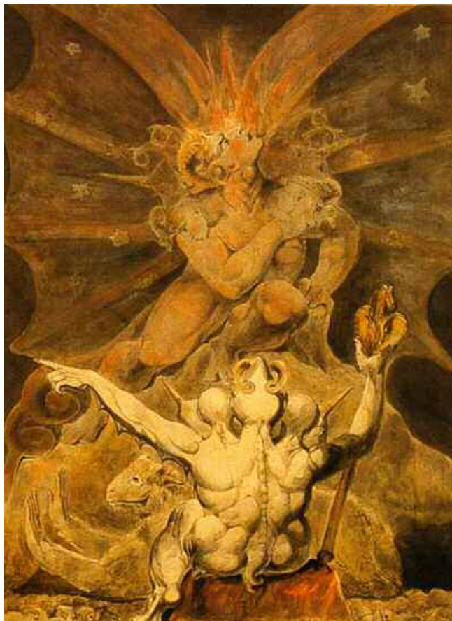
Pen and watercolor drawing, c. 1805, William Blake, Rosenbach Foundation, Philadelphia

This beast appears after the first beast, material man, appears, and attempts to seduce him from