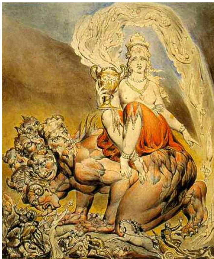
William Blake, 1809, The British Museum, London

Why is the Woman in scarlet and purple called a whore? And what is this fornication? It is the abuse, the illicit violation, of matter. Matter as Mater , mother, that which gives birth to all material form, is of heavenly origin; but here it is stripped of its spiritual context and purpose.