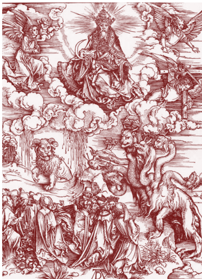
Woodcut, 1496-97, Albrecht Durer, State Hall of Art, Karlsruhe

Now appears another manifestation of Christ ("like unto the Son of Man"—14:14), which is both an echo of and a foil to the "grim reaper," the pale rider on the pale horse. For he thrust in his sickle and reaped the earth. His harvest is the souls that are "saved," though saved, as Peter says, as by fire through tribulation as they witness for Christ and are trod in the winepress of salvific affliction. As the grain of rude event is painfully ground in the mill of retrospection so that nutriment may be extracted for the soul, so are the grapes of earthly