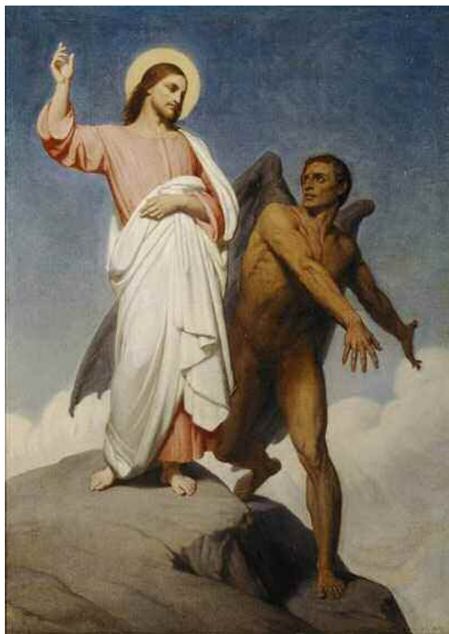
Oil on Canvas. Ary Scheffer, 1795-1858. National Gallery of Victoria, Melbourne

The planet and spirit Saturn is the Satan of the Bible. He is called “Old Father Time” because his mission is limited to time, the period of human unfoldment. He is called “the God of this world,”