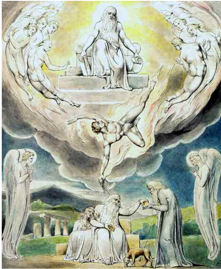
Engraving from Illustrations of the Book of Job , William Blake, 1823, Virginia Museum, Richmond, Virginia

I ask an orthodox professor of Christianity the same question, and his reply is, that God made the rose, which work from the professor's viewpoint