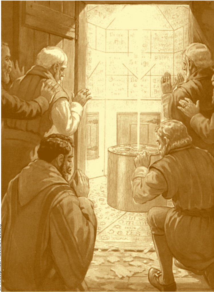
From Manly P. Hall's SECRET TEACHINGS OF ALL AGES