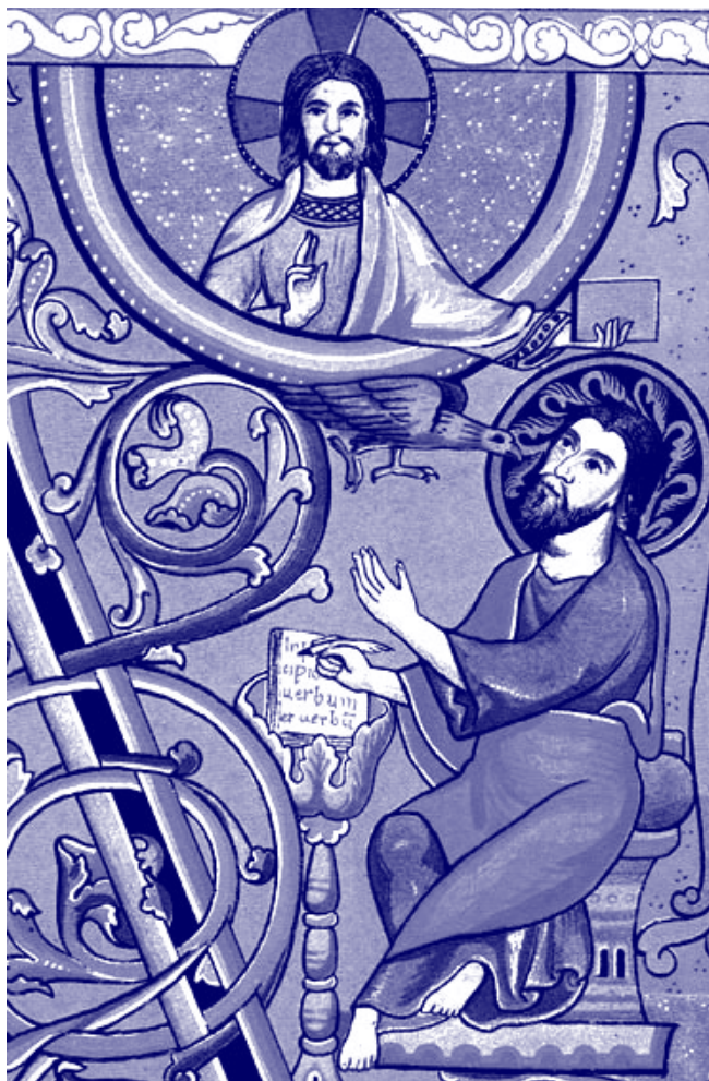
Detail, Illumination, twelfth century bible, Harleian manuscripts, British Museum

But Christ Jesus at His death renounced the vision of the tableau; He gave it up to humanity, and it became the content of what the disciples later "remembered" in the light of the Pentecost-flame. It was also that which the Evangelists contemplated from different points of view, the vision from which they wrote their records. The normal life-tableau is given over to the Gods, the Angels,