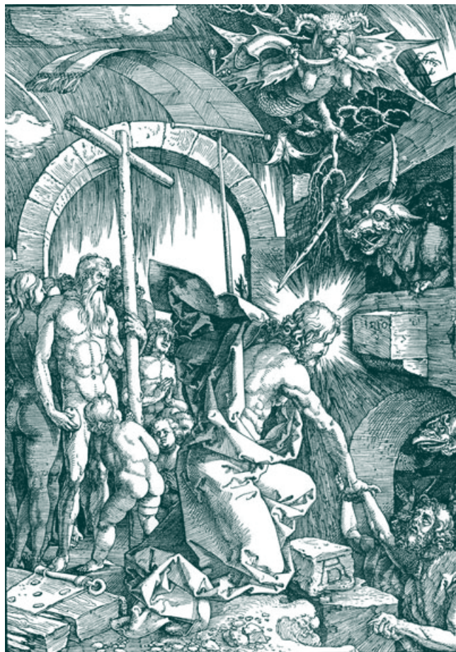
Woodcut from "The Great Passion," 1510, Albrecht Dürer (1571-1628)

By that event it was proved, cosmically and historically, that even in his own kingdom Ahriman is powerless in face of the cognizant courage of Christ—the courage which He pours into the souls