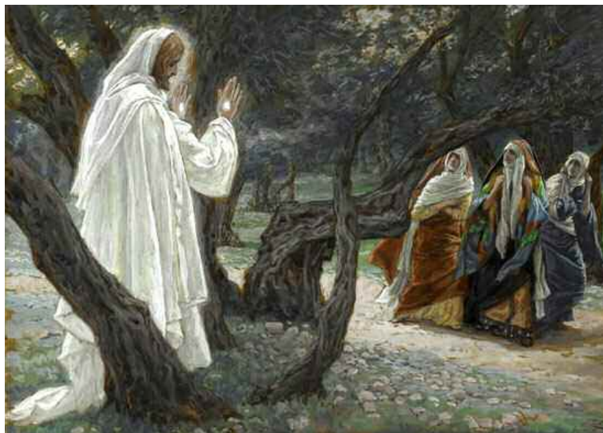
J. James Tissot, Brooklyn Museum of Art

The Risen One was a Being who united in Himself experience of the Heavens, of life and suf-